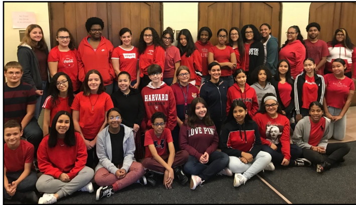
Members of SADD pose in red to kick off Red Ribbon Week. Red Ribbon Week ran from October 21-25. Each day students dressed to raise awareness for SADD Club's message.

The SADD Club, in the past, has organized a program for middle school students about the dangers of smoking and vaping. The program was presented by the TRU Group or the Tobacco