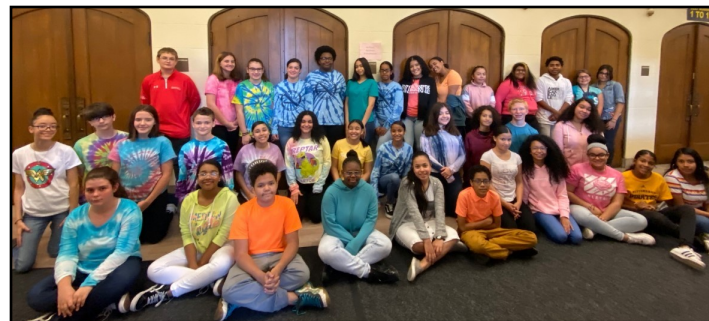
SADD Club sponsored "Don't Get Tied Up in Drugs" on Wednesday, Oct. 23. Students wore tie dyes and bright colors to support this message. (See p. 2 for more photos)